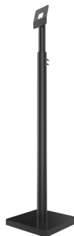
TD-YZJ1005 Floor-Standing Mount