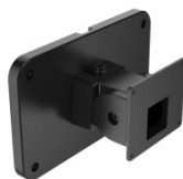
TD- YZJ1003A Wall Mount