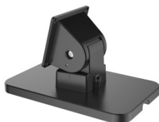
TD- YZJ1003 Desktop Mount