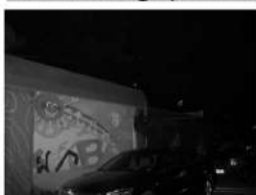
With IR light